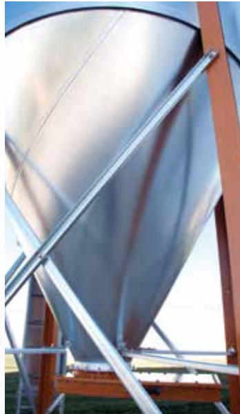
Hopper Cones - 45 or 60 degrees